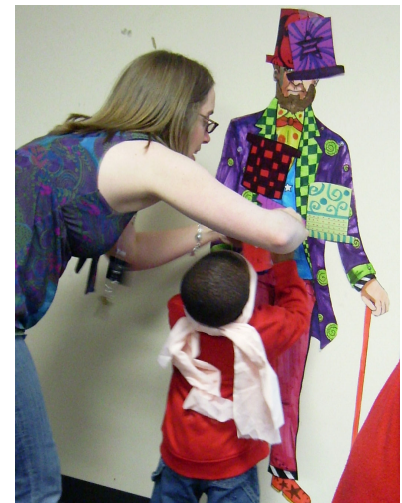
Pinning the Hat on President Lincoln