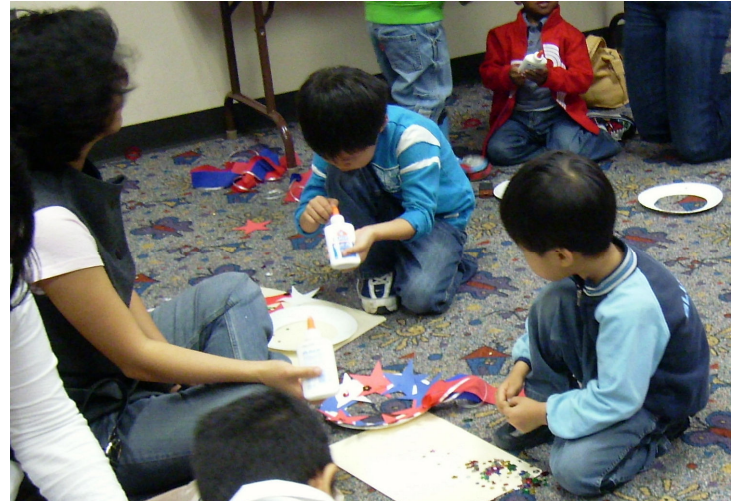
Creating a Red, White, and Blue Patriotic Wreath