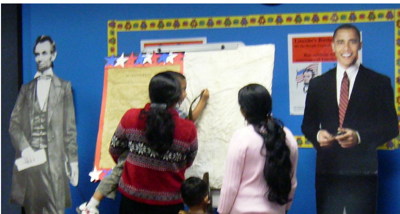
Signing the Declaration of Independence and a photo op with Presidents Lincoln and Obama