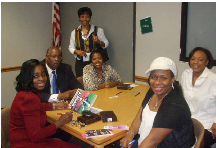
Authors in attendance at the Read-In (L to R)