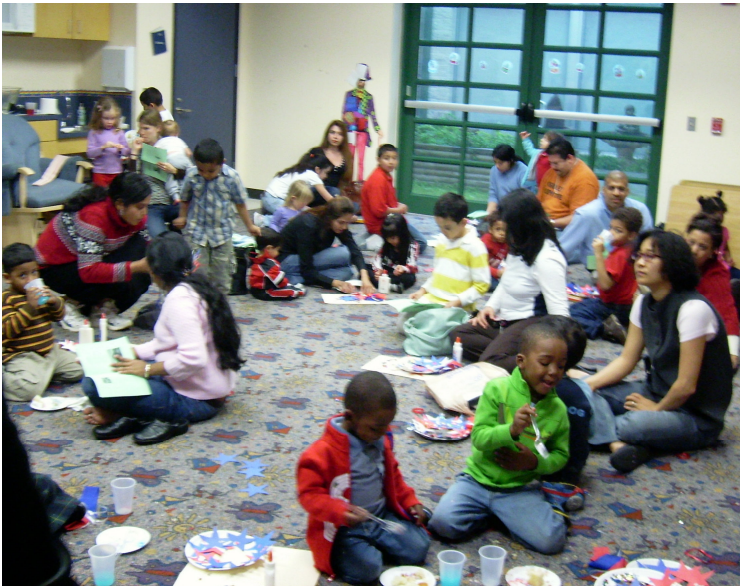
Red, White, and Blue Snacks and a Sing-a-Long